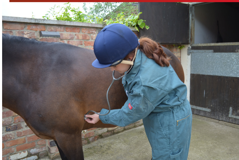
A vet measuring a horse's heart rate