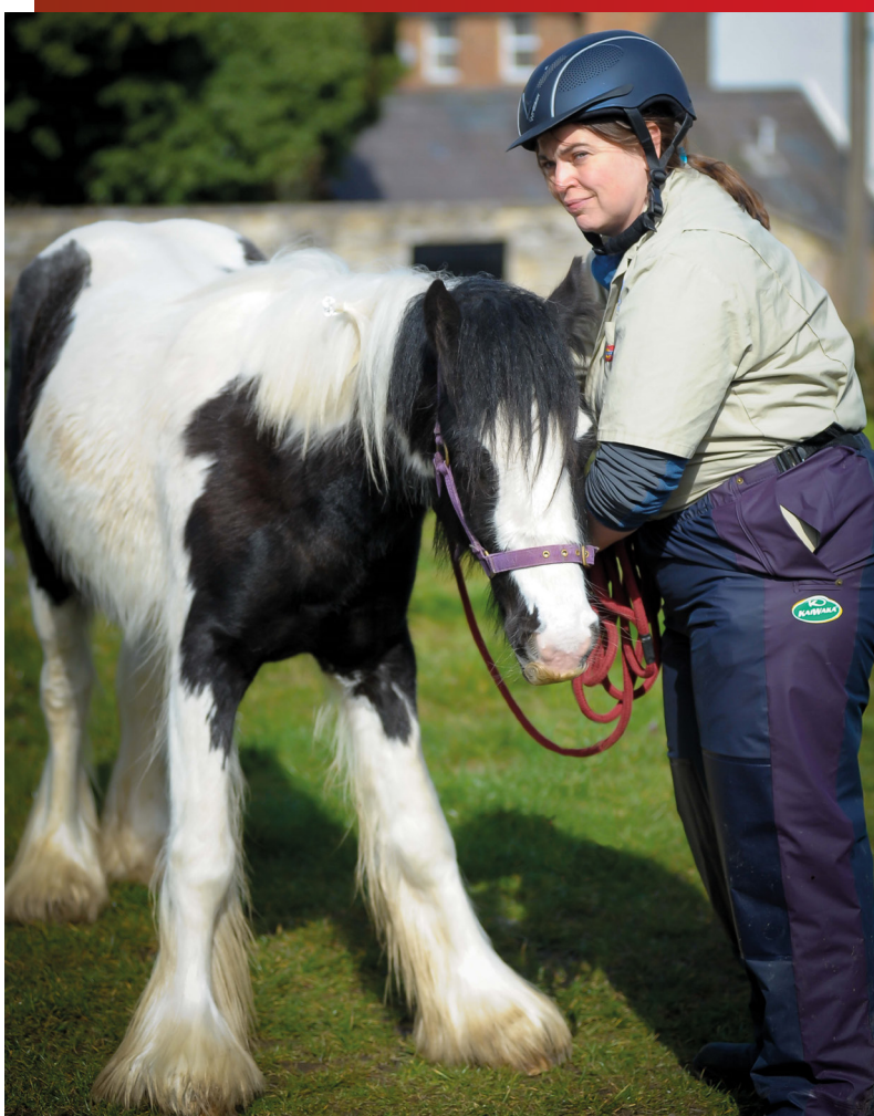
A sedated pony

For more information please visit: bhs.org.uk/colic