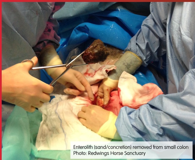
Enterolith (sand/concretion) removed from small colon