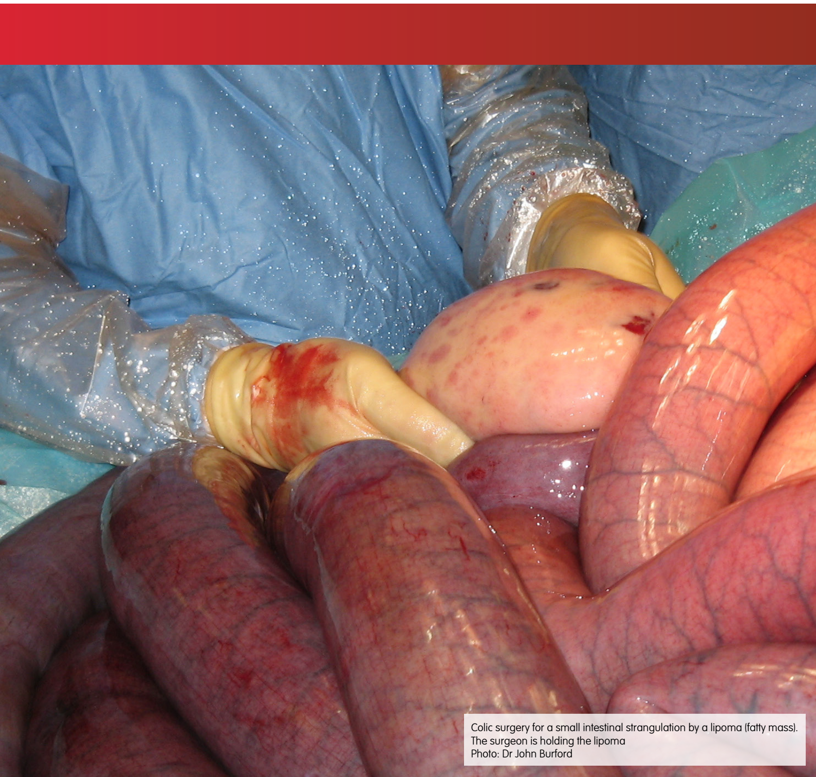
Colic surgery for a small intestinal strangulation by a lipoma (fatty mass). The surgeon is holding the lipoma

There are a range of different causes of strangulations and torsions. However, both types of colic can be severe and surgery will be required urgently. Horses usually show severe and continuous signs of pain, and/or signs of shock (including sweating, dullness and depression).