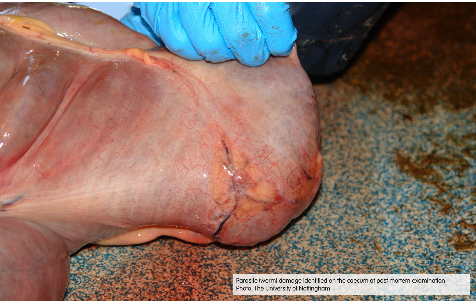
Parasite (worm) damage identified on the caecum at post mortem examination

If you have any concerns for your horse's health contact your veterinary surgeon immediately