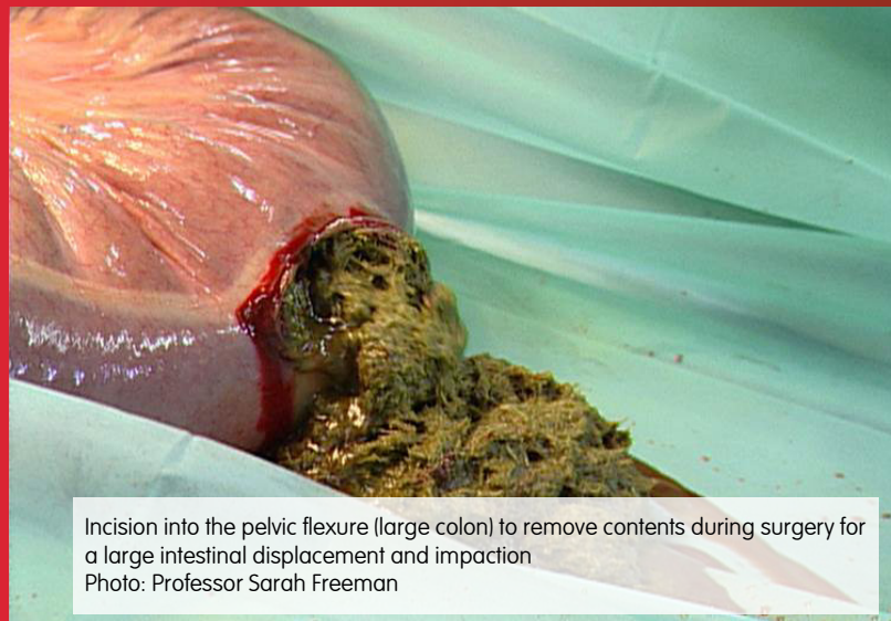
Incision into the pelvic flexure (large colon) to remove contents during surgery for a large intestinal displacement and impaction